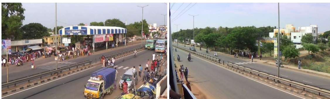
Figure 1: Selected mid-block crossing at Thiruverembur and Balaji Nagar

The required data were collected by conducting videographic survey at the selected locations during peak hours. Peak hours were determined by carrying out a traffic count at an interval of 15 minutes from morning 8am to 10am and evening 4pm to 6pm. From volume count, 9 to 10am and 4.30 to 5.30pm were considered as morning and evening peak hours respectively. The selected study locations are presented in Figure 1.